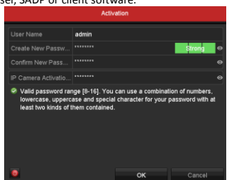
Figure 3-1 Set Admin Password

STRONG PASSWORD RECOMMENDED—We highly recommend you create a strong password of your own choosing (Using a minimum of 8 characters, including at least three of the following categories: upper case letters, lower case letters, numbers, and special characters.) in order to increase the security of your product. And we recommend you reset your password regularly, especially in the high security system, resetting the password monthly or weekly can better protect your product.