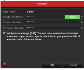
Figure 3-1 Set Admin Password

STRONG PASSWORD RECOMMENDED—We highly recommend you create a strong password of your own choosing (Using a minimum of 8 characters, including at least three of the following categories: upper case letters, lower case letters, numbers, and special characters.) in order to increase the security of your product. And we recommend you reset your password regularly, especially in the high security system, resetting the password monthly or weekly can better protect your product.