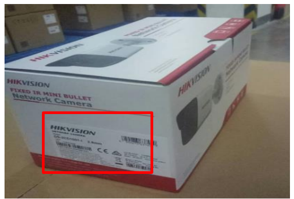
Figure 3 TOE box containing the TOE

The package contains a box with the TOE (see Figure 3). The user must verify that the information of the box is consistent to the HW and SW details provided by Hikvision.