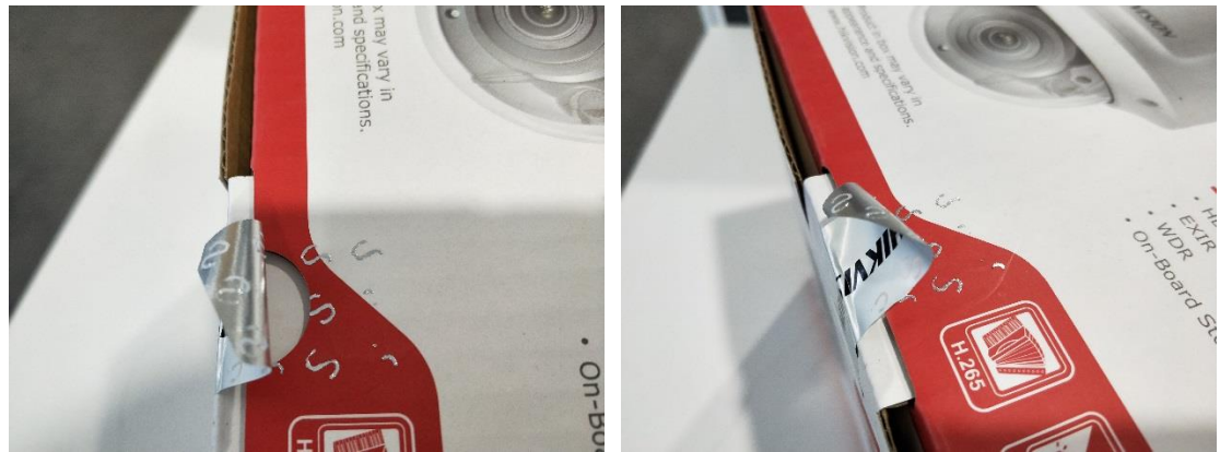
Figure 2 Tamper seal sample after a tampering attempt

The user must check that the tamper evident tape. If any irregularity is found, the user must not accept the package and must contact Hikvision in case of any issue happens during the delivery process to return the TOE. Hikvision will provide a replacement of the TOE.