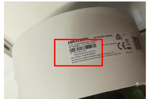
Figure 4 TOE label