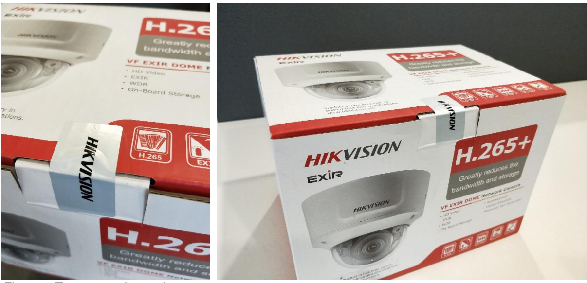
Figure 1 Tamper seal sample

The user must track the package and verify that the shipping details are coherent with the information provided by Hikvision once the package is received. If any inconsistency between the information sent by Hikvision and the actual delivery is detected, the user must not accept the package.